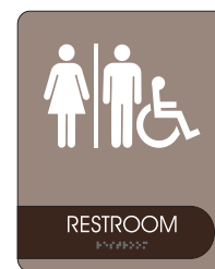
Shown in: Dark Brown and Taupe