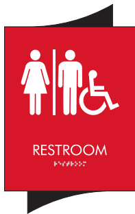
Shown in: Red and Black