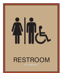
Shown in: Dark Brown and Taupe