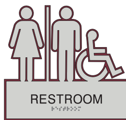
Shown in: Pearl Grey and Bordeaux