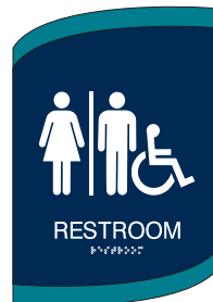
Shown in: Marine Blue and Bahama Blue